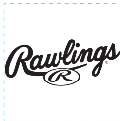
COLORS PMS 289 Navy