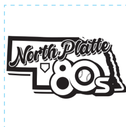
COLORS PMS 289 Navy